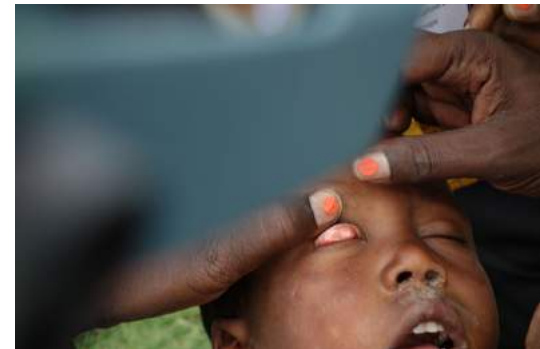
A grader examines a child using the Follicle Size Guides