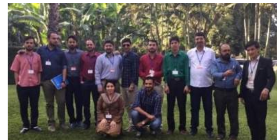
Trainees from Afghanistan at our training in Tanzania