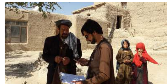
Teams in the field in Afghanistan