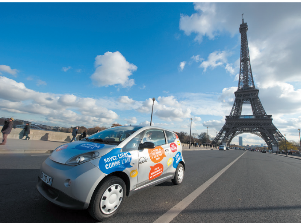
Autolib car-sharing schemes free users from the demands of ownership.

parts are classified according to their residual value. Worn parts are sold for remanufacturing, broken ones for recycling. These markets used to be common — milk and beer bottles and old iron were once collected regularly from homes. Some have re-emerged as digital global market places, such as eBay.