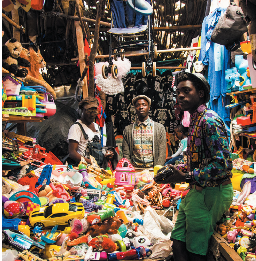
Stalls known as mtumbas ('second-hand' in Swahili) in Nairobi sell repurposed goods, many from the West.