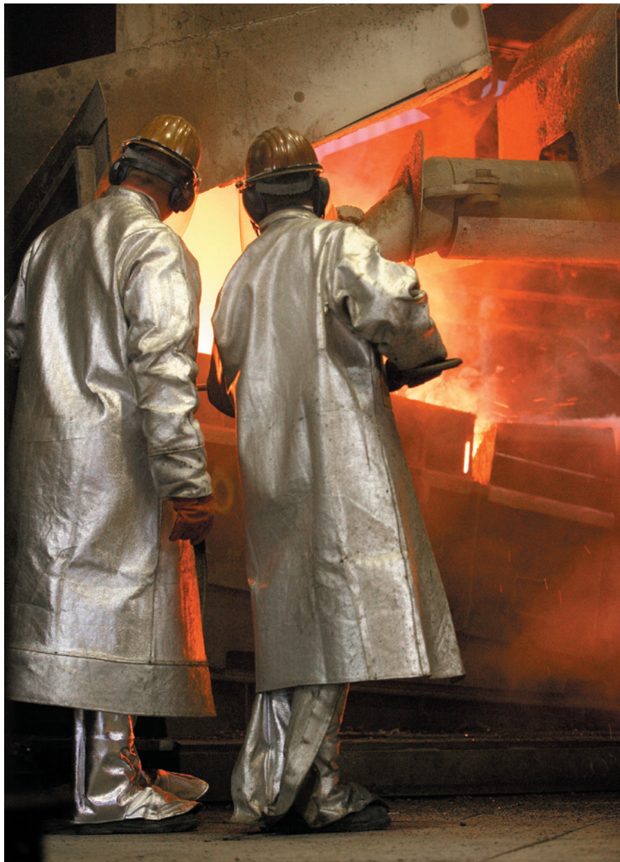
Workers at Umicore in Brussels separate out precious metals from electronic waste.