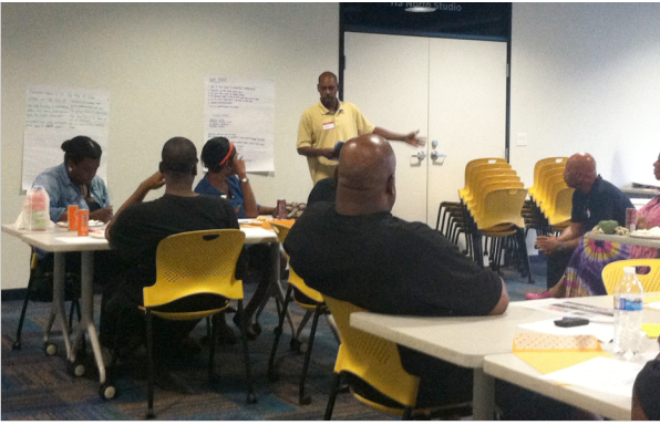
Figure 1: Workshop “Learning Activity” – group report out

technologies [17]. Further, the need for an established reputation could be restrictive due to limited social capital among these groups [7,17]. Our research extends this work by evaluating the validity of these findings among a disadvantaged population.