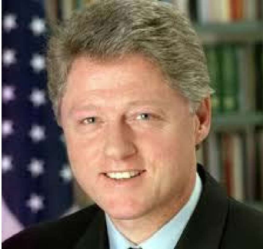
President Bill Clinton.

To what extent was Bill Clinton’s presidency a time of national prosperity?