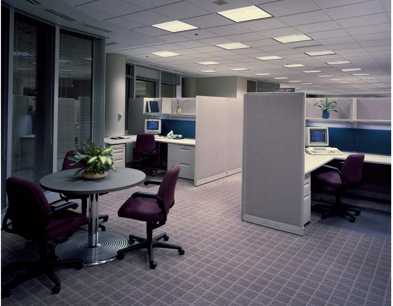
Office cubicles in the headquarters of the Washington Suburban Sanitary Commission. Photograph by Carol Highsmith, 1980 (Library of Congress: Prints and Photographs Division)

Why did the American workforce evolve in the 1980s and 1990s?