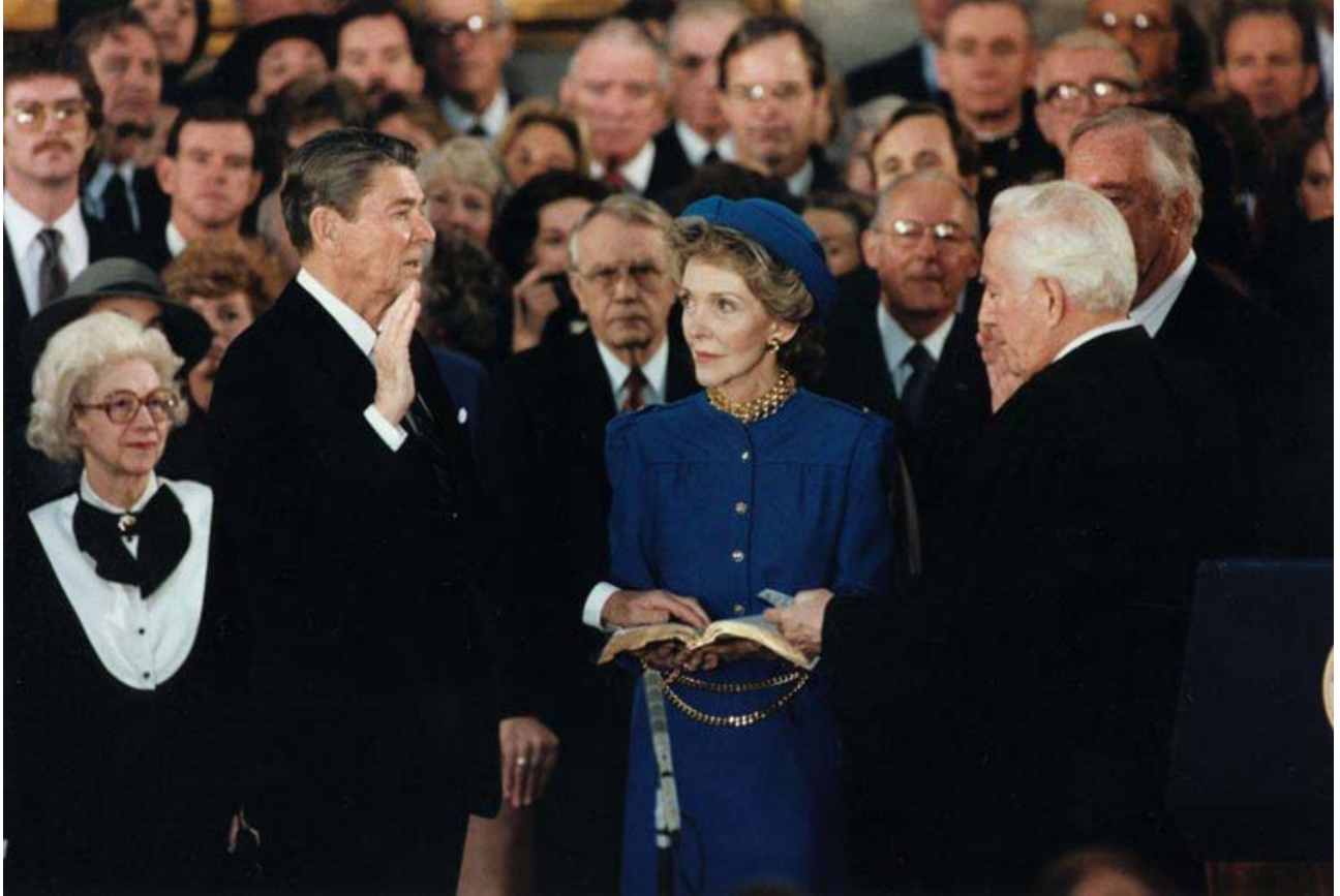
President Ronald Reagan being sworn in for his second term in the U.S. Capitol, January 21, 1985

To what extent was Ronald Reagan’s presidency revolutionary?