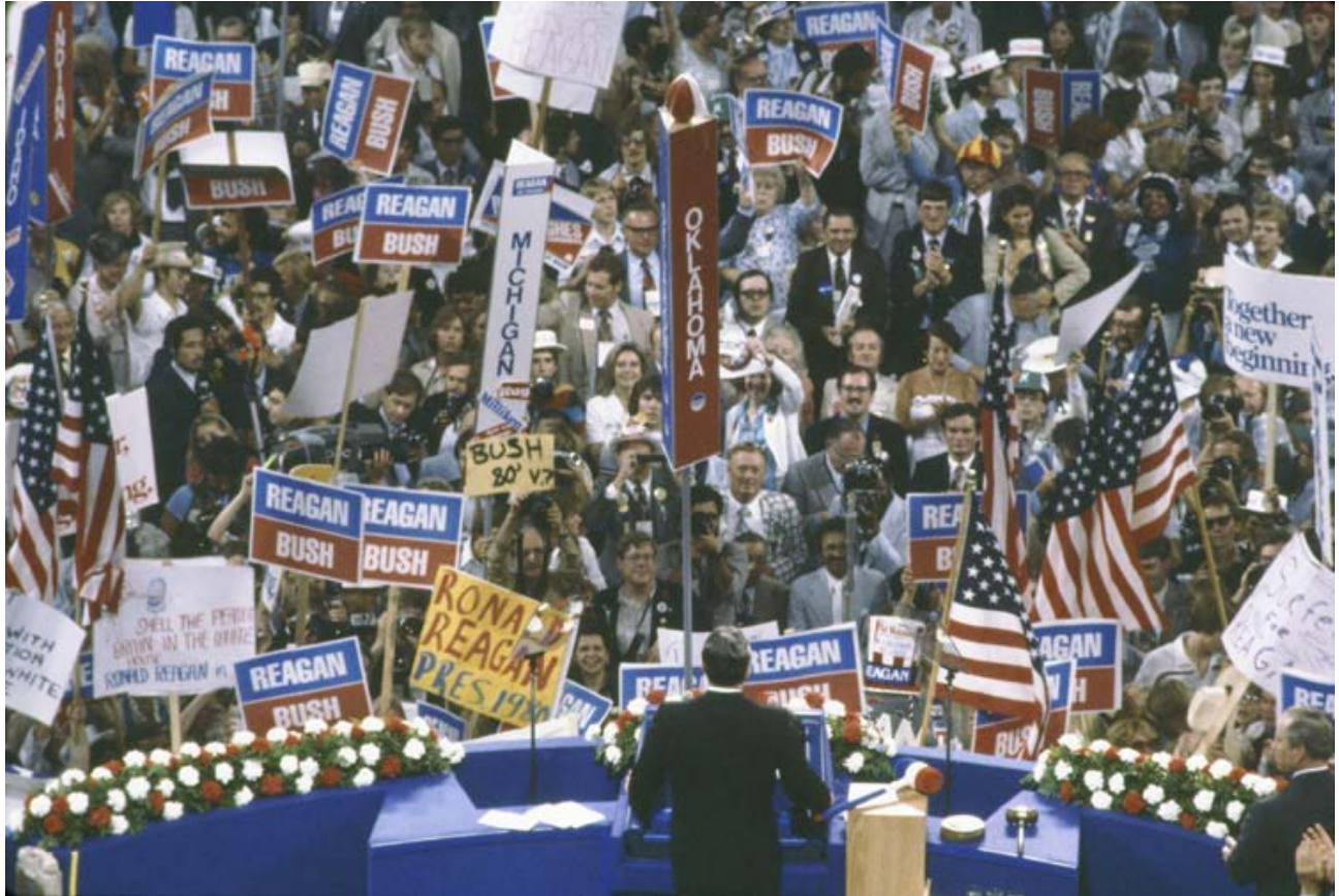
Ronald Reagan giving his acceptance speech at the Republican National Convention at Joe Louis Arena, Detroit, 1980