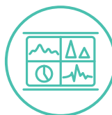
Data Analytics on Building Environment