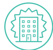
Building Supports Core Mission