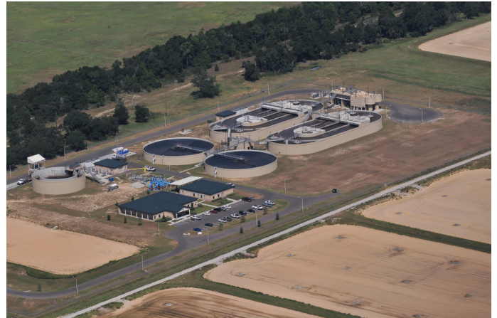
The Arbennie Pritchett Water Reclamation Facility, built on Eglin AFB property under an enhanced use lease, serves both the Air Force and Okaloosa County.

The southern portion of Okaloosa County had been designated a "water use caution area" by the local water management district as strained aquifers were experiencing saltwater intrusion and a sinking water table. As a result, the water district and state regulators were encouraging utilities and their customers to use reclaimed water for irrigation as a way to sustain the region's water supply over the long term.