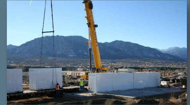
Peak Shaving Battery