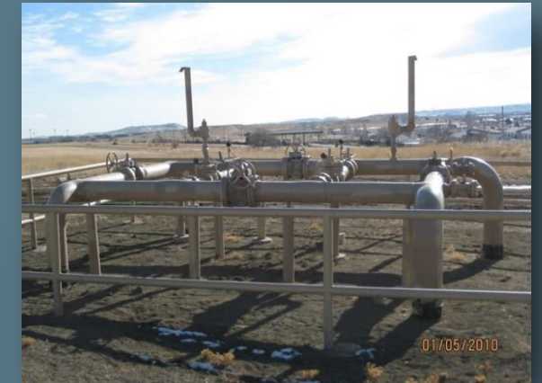
Fort Carson Natural Gas Regulator Station