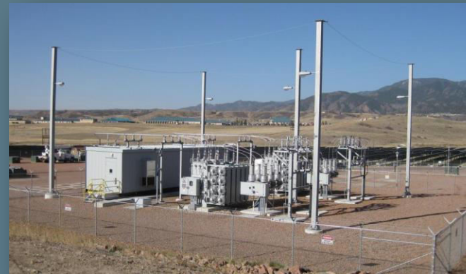
1 of 3 Fort Carson Substations