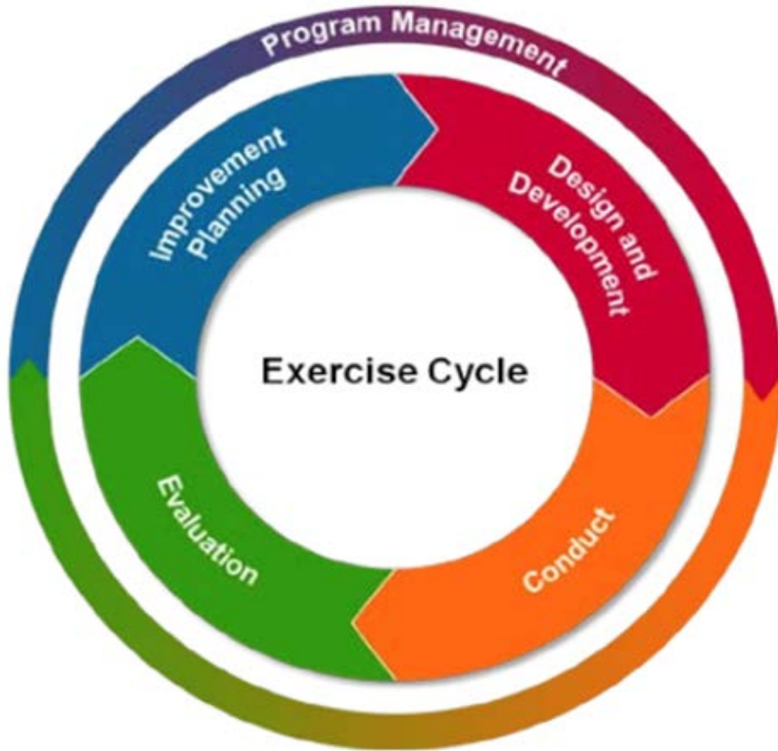
Figure 1.1: HSEEP Exercise Cycle