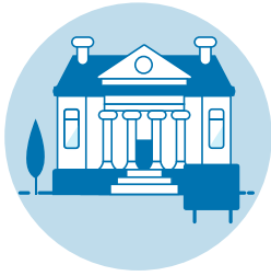
Higher ed exams & quizzes

Low-to mid-stakes assessments in which active intervention during a session is not necessary.