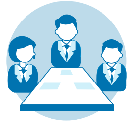
Corporate training certifications

“When my quizzes were not proctored, the average grade was 99%. After adding ProctorU’s Review + , the average grade dropped to 80% which was more in line with my expectations. There is an absolute direct relationship between a lower grade average and implementing the automated proctoring with professional review. I am significantly more confident that my students are unable to gain an unfair academic advantage.”