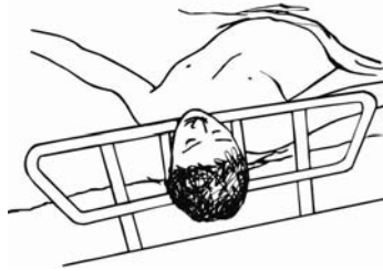
Zone 1 – Entrapment within the rail