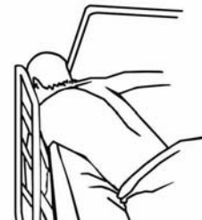
Zone 6 – Entrapment between the end of the rail and the side edge of the head or foot board