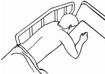
Zone 3 – Entrapment between the rail and the mattress