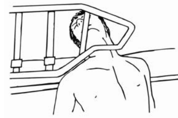
Zone 4 – Entrapment under the rail, at end of rail