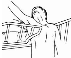
Zone 5 – Entrapment between split bed rails