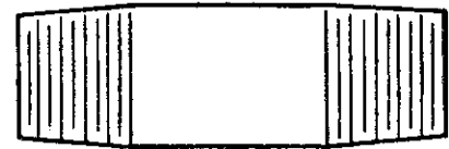
1/4" x 1-1/2" Close Nipple 82571-03