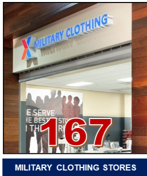
MILITARY CLOTHING STORES