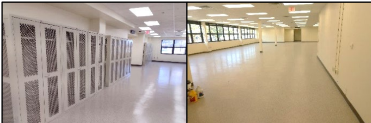
CIRM Project: DFAC to Company OPS Facility conversion