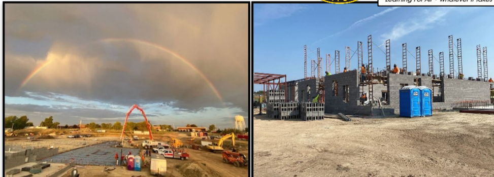
New Elementary School Construction on Fort Riley

Fort Riley continues to strengthen Community Partnerships and be good stewards of taxpayer dollars