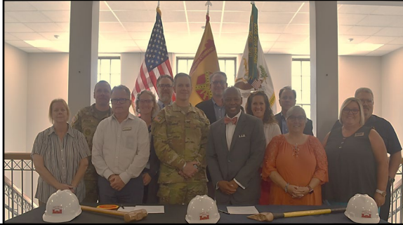
USD 475 - Fort Riley D-B CIRM IGSA Team