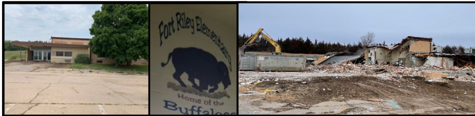
Old Fort Riley Elementary School Demolition

Effects: Realize cost cutting efficiencies and timely demolition of the old FR Elementary School on Fort Riley while strengthening community relationships through the Army's first Demolition Services IGSA.