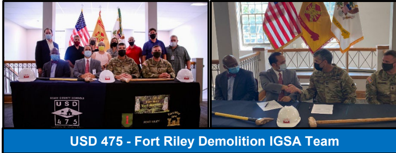
USD 475 - Fort Riley Demolition IGSA Team