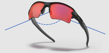
(e.g. FLAK 2.0 XL)