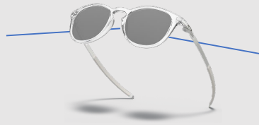
(e.g. PITCHMAN R)