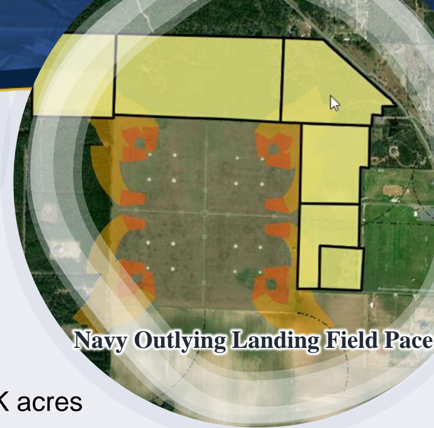
Navy Outlying Landing Field Pace