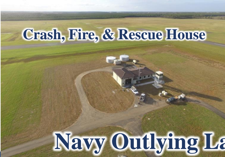
Crash, Fire, & Rescue House