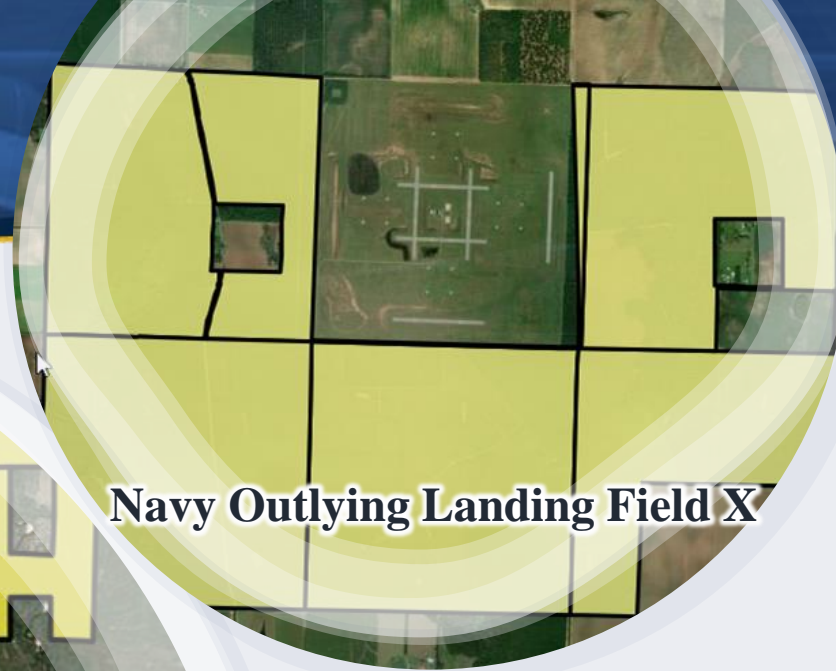
Navy Outlying Landing Field X

Readiness Environmental Protection Initiative (REPI) 10 U.S.C. §2864a