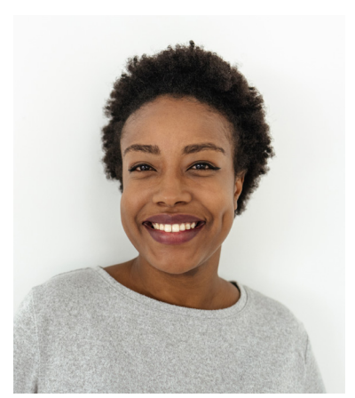
BLACK & WHITE