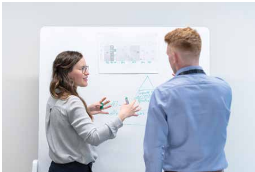
Fig. 1 The "Science Test" Requirements