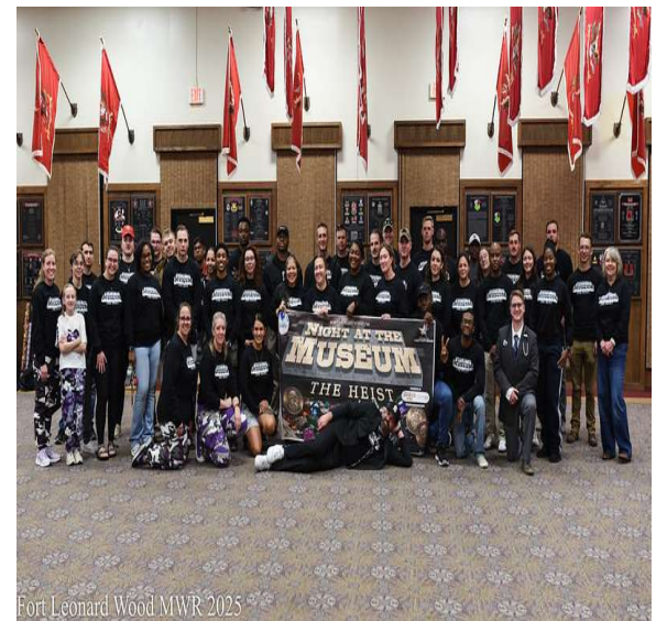
Fort Leonard Wood MWR 2025