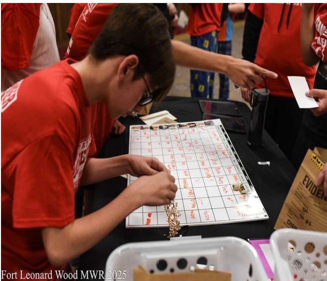
Fort Leonard Wood MWR 2025