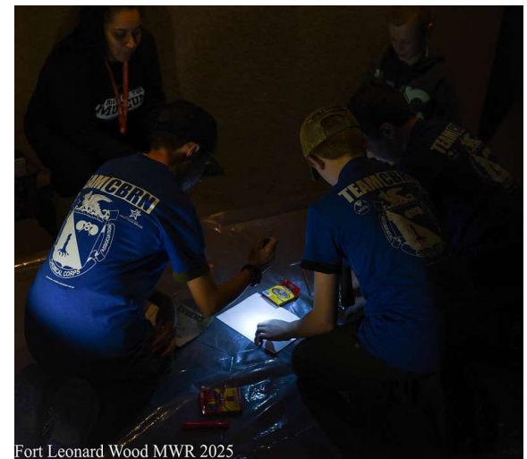
Fort Leonard Wood MWR 2025